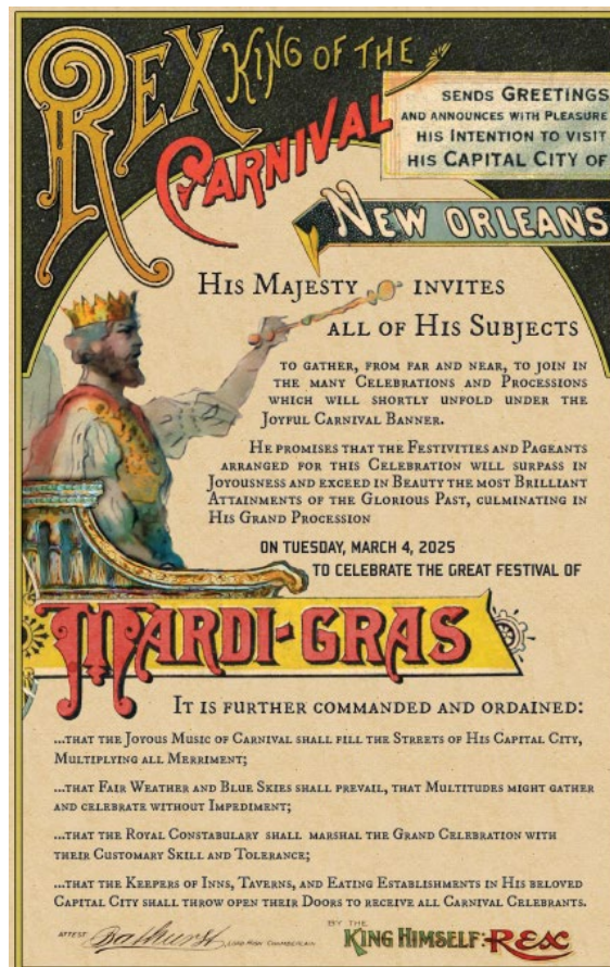
Rex's Royal Edict Proclaiming Mardi Gras 2025